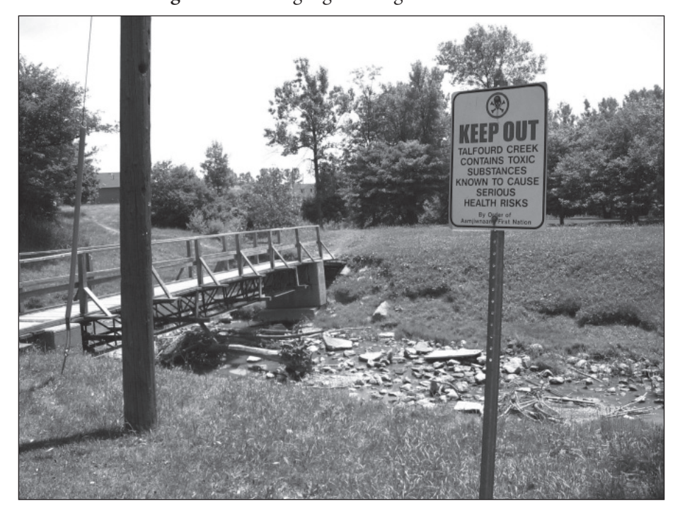
Figure 2: Warning Signs Along Tafourd Creek.

The pollution of the creek led many residents to express fear for the future health of their children (see Luginaah et al., 2002). Children enjoy playing in this creek, and many parents talked about the difficulty in "asking their children not to play outside". Others feel that the children in the community will not grow up as they should, especially if "they are told to be afraid of Mother Earth":