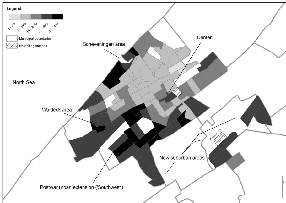
Figure 1: Share of votes for PVV per neighbourhood during the 2010 municipal elections in The Hague, shares corrected for ethnic composition (Turkish- and Moroccan-Dutch adults).

At first glance and also based on additional information on the historical, socio-economic, ethnic, and residential structure of the city (Schmal 1995; Bolt et al. 2008; Teernstra and Van Gent, 2012), the map shows a high level of RRPP support in three types of neighborhoods. The first consists of some specific neighborhoods close to the North Sea coast, which have a high share of native Dutch working class residents. These relatively poor neighborhoods are part of the Scheveningen fishing