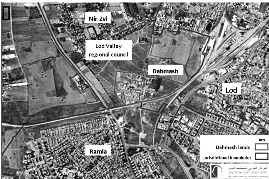
Figure 1: Dahmash and its neighbouring settlements.

during the Nakba in 1948 (the Palestinian dispossession during the establishment of Israel; on this common practice, see: Falah, 1996). Some bought their land from its previous owners. Although the residents own most of the land, since 1984 it has been designated for agricultural use only, rendering the buildings illegal (Ministry of Interior, 2013). As a consequence, Dahmash has no amenities such as water and sewage, street lights, electricity, roads and waste collection ( ibid ). The residents have no residential address but some are registered in the neighbouring city Ramla, where they receive welfare services and the children attend school. These services are presented as a matter of fact by the state (High Court 5435/14:4, section 16), although they are also contested and in some cases the local authorities refused to provide transportation for pupils or education for an infant with special needs until the matters were settled in court ( Minor vs The State [2009], AN 2399/08). The settlement is therefore informal in the sense that it is not recognised as an entity by the authorities, is not connected to basic amenities, and is illegal (Roy, 2005).