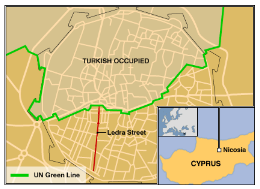
Figure 2: Nicosia and the Buffer Zone cutting through its centre.

controls 63,7% of the island (South), also shares at least its language and anthem with Greece, and upon joining the European Union and serving as its president, it has also become formally politically attached to it (Bryant, 2006).