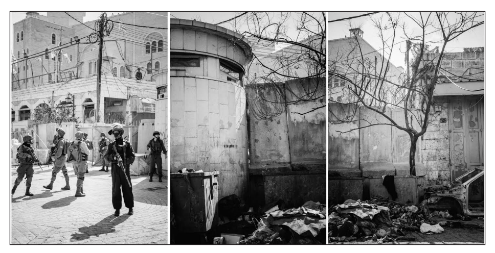
Figure 1: Hebron 2016. An Israeli military patrol at the Shuhada Street adjacent to the buffer zone – a view from H2.