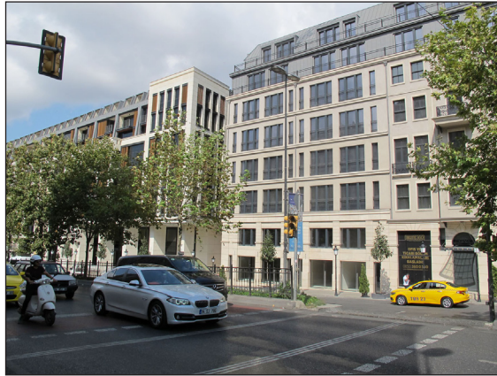
Figure 3: Tarlabasi, after the project

Both Cihangir (Selek, 2001; Zengin, 2014) and Tarlabasi (Zengin, 2014) have been critical sites of radical activism in the wake of gentrification and particularly state-led gentrification. While Cihangir has been one way or another a part of discussions in the literature regarding the LGBT issues, we point out the missing discussions of Tarlabasi and the significant potential of the community acts in the LGBT activism and movement (Gocer, 2011).