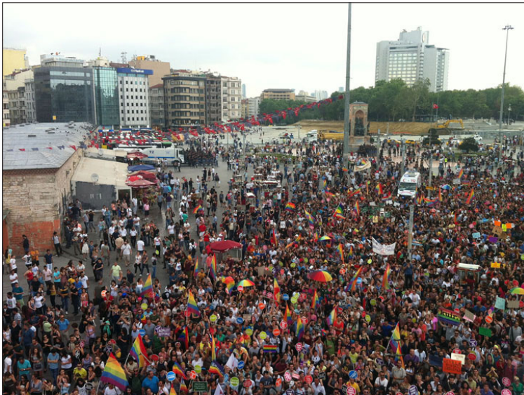
Figure 4: LGBT Pride Parade, Taksim Square, Beyoglu, Istanbul, Just after Gezi Protests in 2013

The Gezi Park protests also created a critical space for increasing the visibility of the LGBT activist movement. Pride parades which are held on Istiklal Street in Beyoglu and started with gathering of participants at Taksim Square by Gezi Park reached record attendance numbers in 2013 and 2014 after Gezi Movement, but