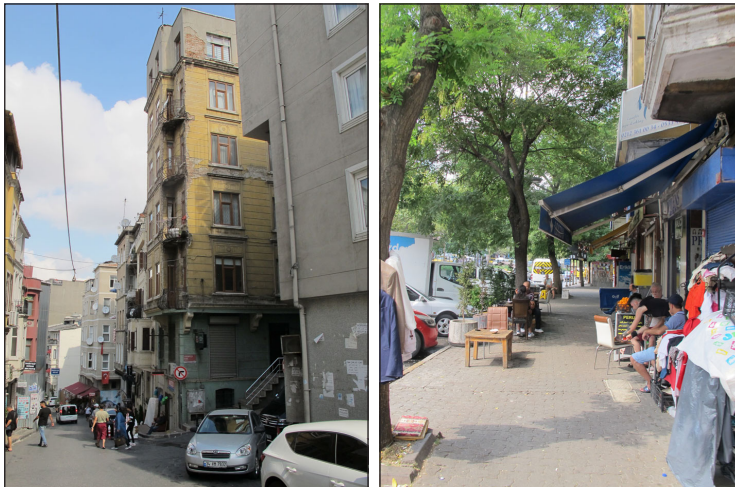
Figure 2: Tarlabasi, before the project

After leaving Cihangir, the trans community in Tarlabasi was confronted by a more organized structure of state and private sector partnership and their sharp interventions in the cleansing of the area. Trans individuals in this case continued to struggle against the dislocation, and found innovative ways to survive. Although being trapped within the restructuring of neoliberal governance that has been established through public-private partnership between the local government and private