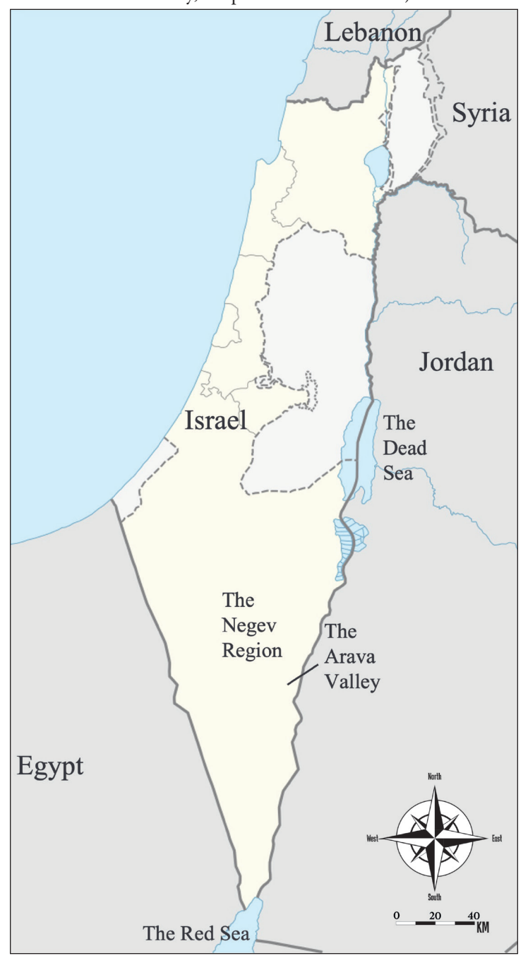
Figure 1: The Arava in the Negev region in Israel (map by NordNordWest, Ynhockey, adapted from Wikimedia)