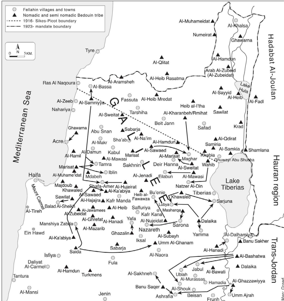
Table 1: Bedouin tribes/families who settled in permanent localities during the British Mandate, 1918-1948